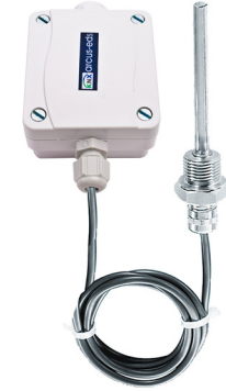
SK01-T-ESTF with Screw-In / Immersion Probe Probe length: 50 / 100 mm 1,5m ( PVC / Silicon )