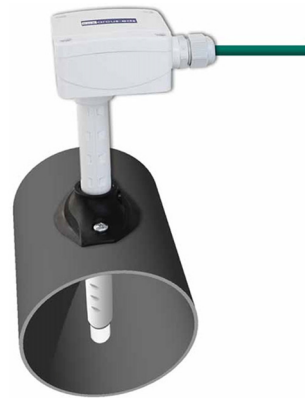
SK10-THC-CO2-KF Air Duct Sensor