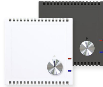
SK30-THC-R white / anthrazit