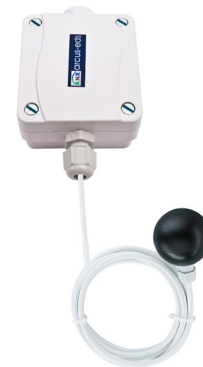
SK10-TC-RPTF2 Dark Radiation Sensor 1,5m PVC