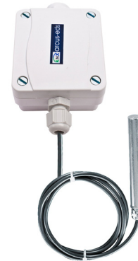
SK10-TC-RPTF1 Pendulum Room Sensor 1,5m PVC