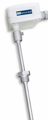
SK10-TC-ETF3 Screw-In / Immersion Sleeve Sensor length: 50 .. 400 mm with Extended Shaft V4A