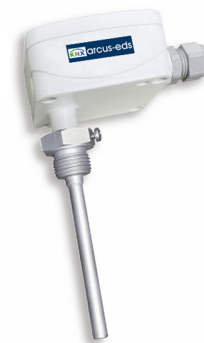
SK10-TC-ETF2 Screw-In / Immersion Sleeve Sensor length: 50 .. 400 mm V4A