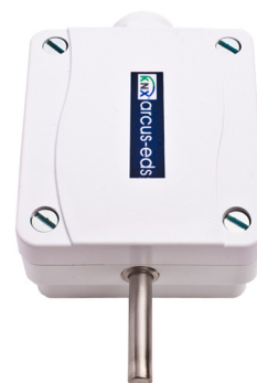
SK10-TC-ATF2 External Sensor