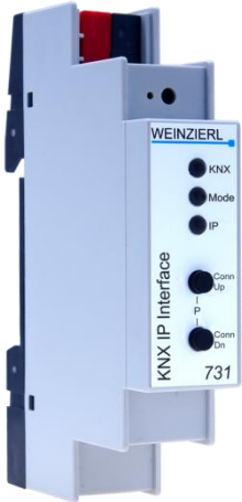
Photo of the device

Compact bus powered interface between LAN/Ethernet and KNX bus